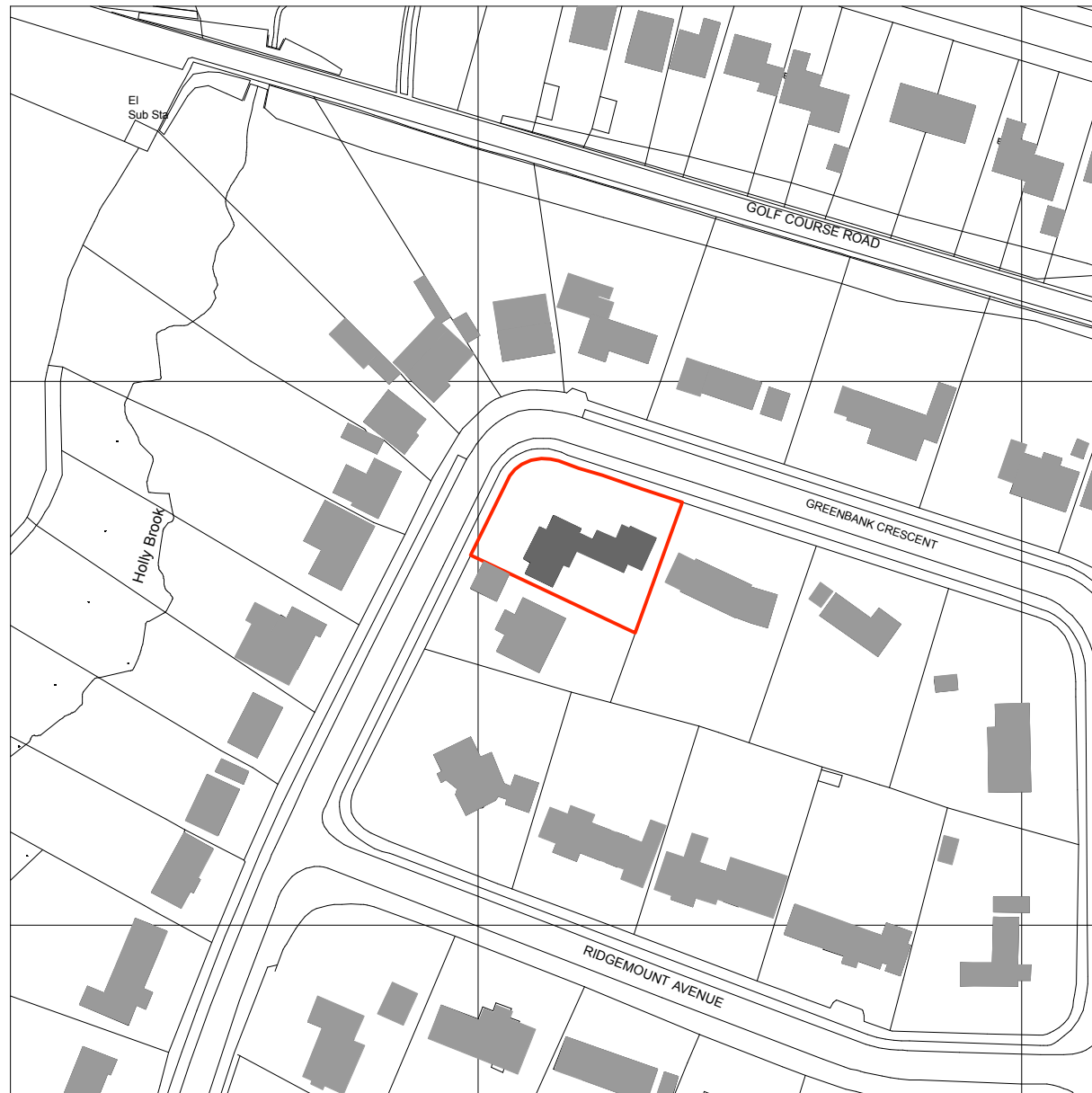
existing location plan